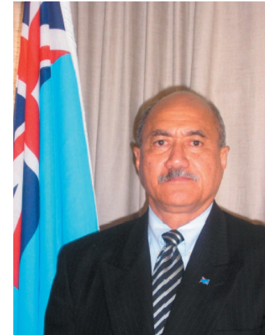
Major General JIOJI KONOUSI KONROTE (Ret'd) OF (Mil) MC, BStJ, MSD, Fellow (ACDSS)psc

Major General Konrote's 41 years of service for his country and its people is a paragon of loyalty, courage and devotion to duty in his performance as a Military Commander, honesty and dedication as a Senior Civil Servant and tact and perseverance as a Diplomat.