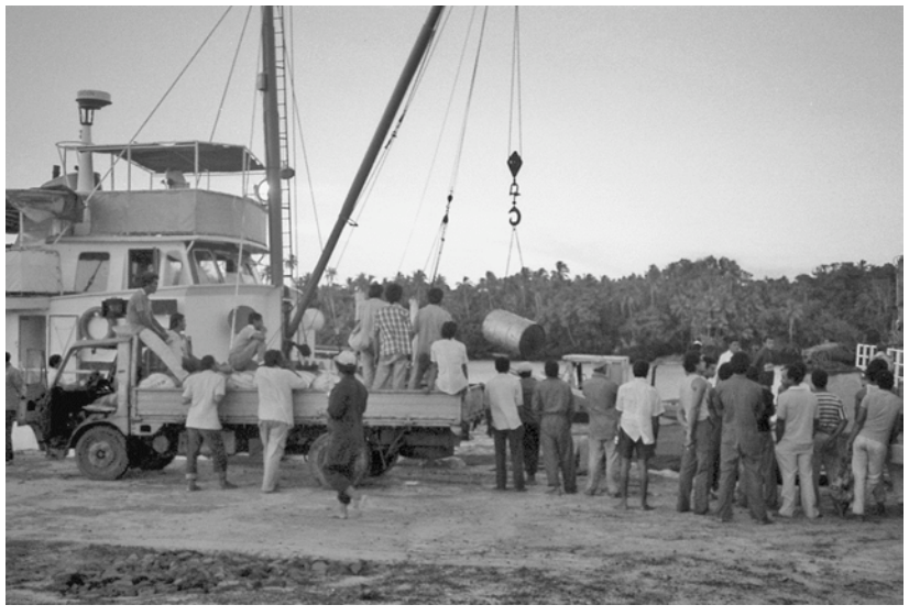
Photo 10.2 Unloading cargo from Fiji at Oinafa wharf, 1988.