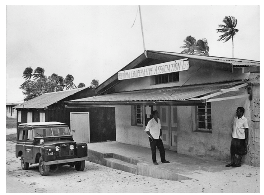
Photo 10.7 Rotuma Cooperative Association headquarters in Noa'tau, 1971.