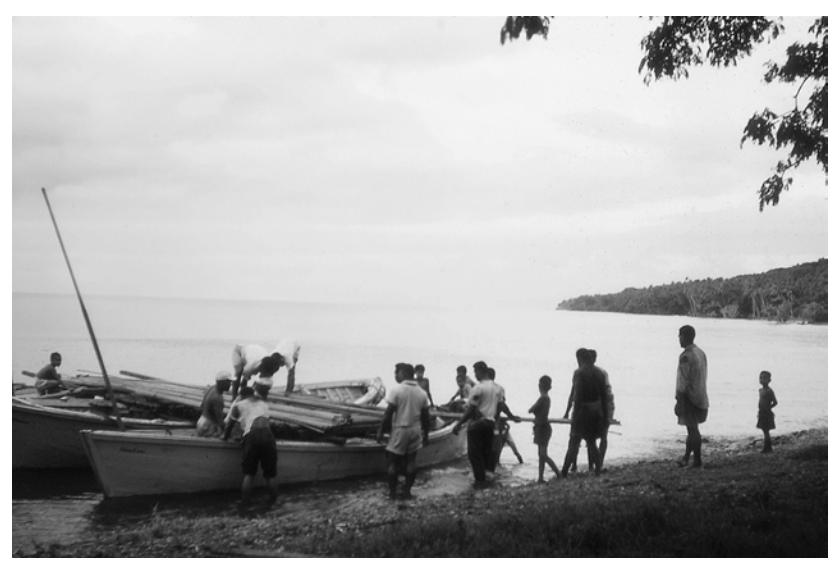
Photo 10.1 Unloading supplies brought by the Yanawai , anchored off the reef at Maka Bay, 1960. Alan Howard .