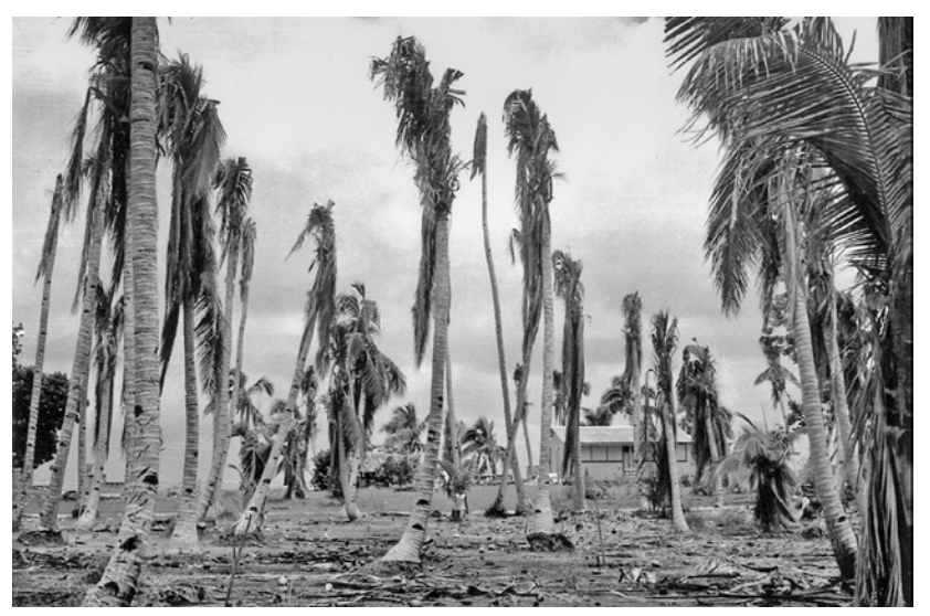
Photo 10.4 Devastation to coconut trees following Hurricane Bebe, 1972. Richard Mehus.

resulted in marked drops in production. The Rotuma District Officer's annual report of 1943 blamed an outbreak of coconut bud rot for low yield in that year, and the 1968 report cited aging trees for falling production. Local infrastructural factors also affected copra sales. The availability of motorized transport allowed increased output in 1924, while insufficient drying and storage facilities, combined with inadequate shipping, forced Rotumans to limit production in the 1940s and the late 1960s.