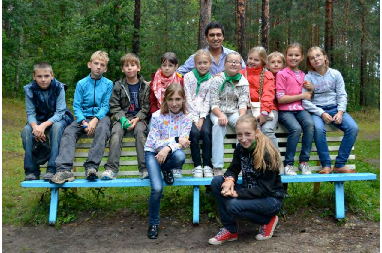
ORANGE LANGUAGE CENTRE CAMP, LUGA, RUSSIA