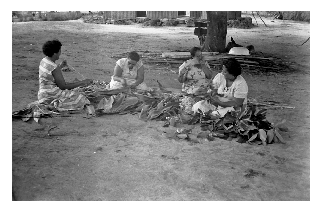
Women preparing pandanus leaves prior to weaving mats (Rotuma, 1960).