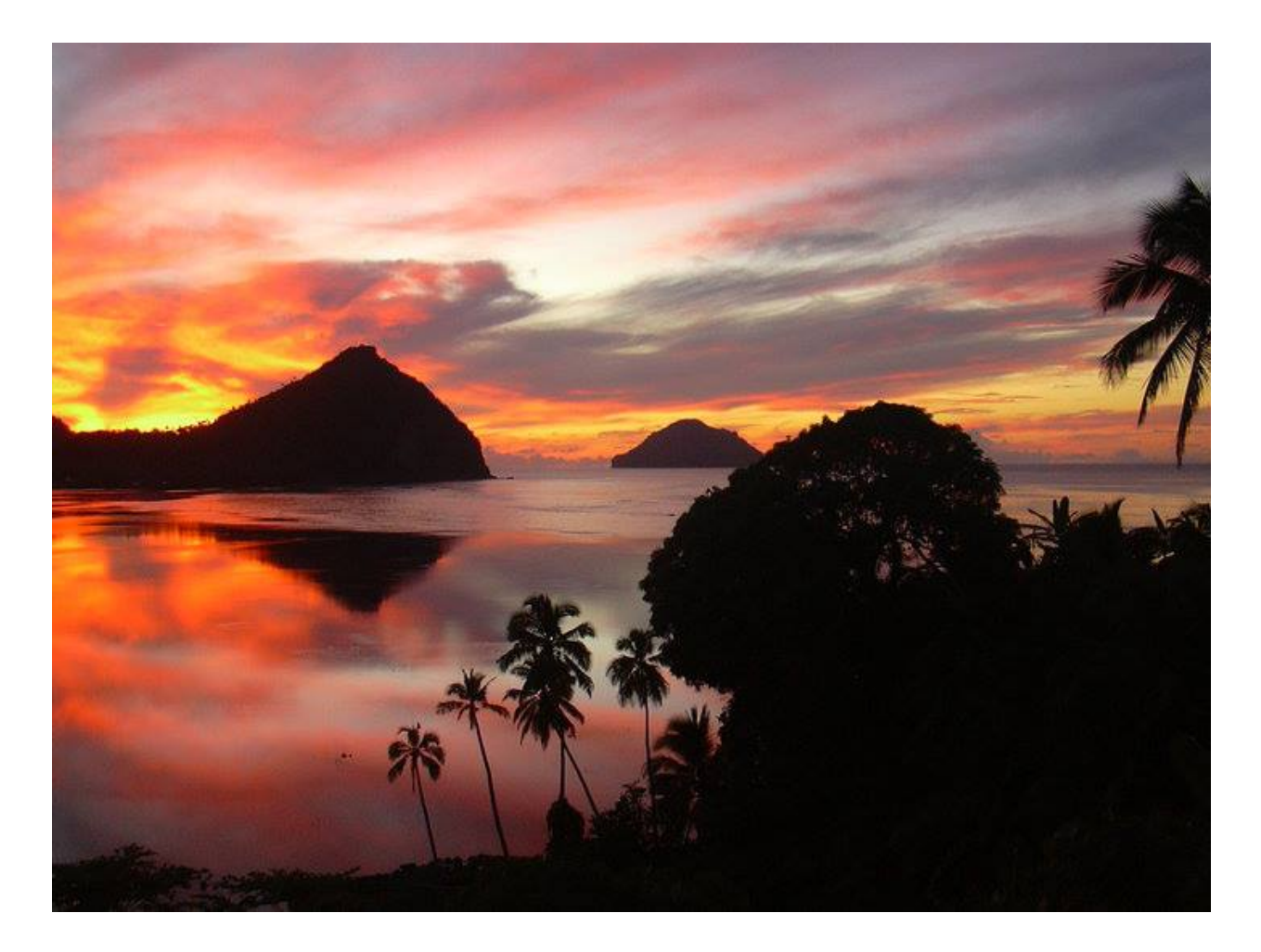
View across Maka Bay at sunset (Rotuma, 2010).

Another category of photos are those recording events, some of which are considered to be of particular historical value—for example, the opening of the council house in 1971, the devastation caused by Hurricane Bebe in 1972 (see above), the 100th anniversary celebration of cession to Britain in 1981, and the 150th anniversary celebrations of the first arrival of Methodist and Catholic missionaries in 1989 and 1996, respectively. Such photos seem to be less highly valued by most Rotumans unless they include images of kinsmen or close friends, or in some instances, buildings or places of special interest (e.g., one's home that had been damaged in Hurricane Bebe). An exception to this are occasional booklets printed by Rotumans to commemorate historical events such as the anniversaries of missionary arrivals.