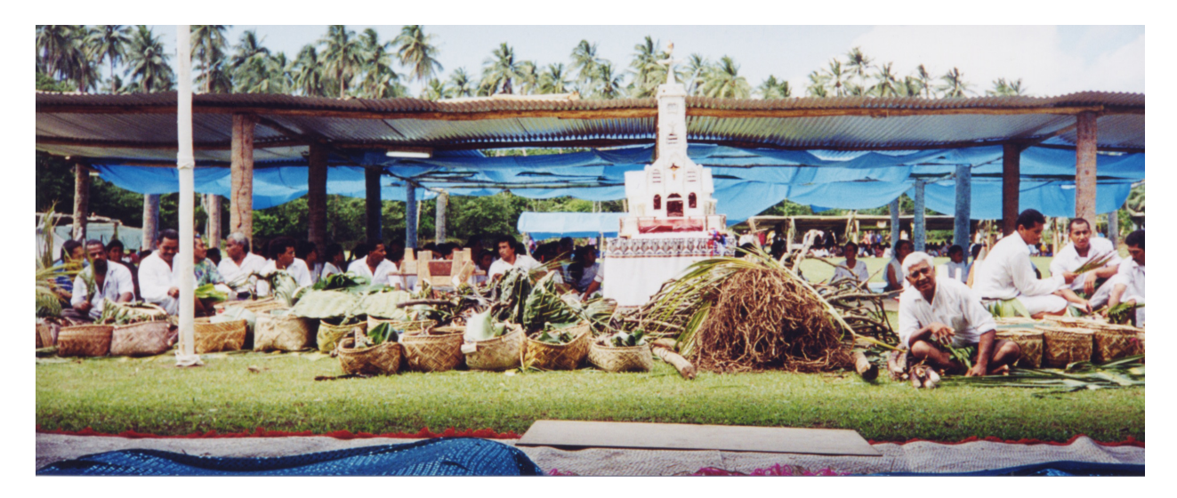
Panoramic photo of food presentation at 150th anniversary of Catholic mission, showing cake in the shape of the Sumi Mission Church (Rotuma, 1996).

widely dispersed Rotuman community, and early in the 21st century we decided to write a history of the Rotuman people.