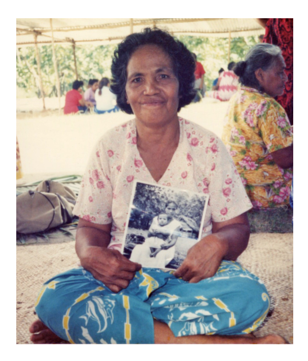
Woman with photo of self from 27 years earlier (Rotuma, 1987).

The photos and slides were taken to provide visual reminders of our experiences on the island, as supplements to our field notes, and as potential illustrations for publications and lectures. At times, Rotumans specifically requested or instructed us to take particular photos, especially at ceremonial events. Interestingly, they never asked for copies of the photos; they just wanted to be sure we were photographing the things that were important from their point of view.