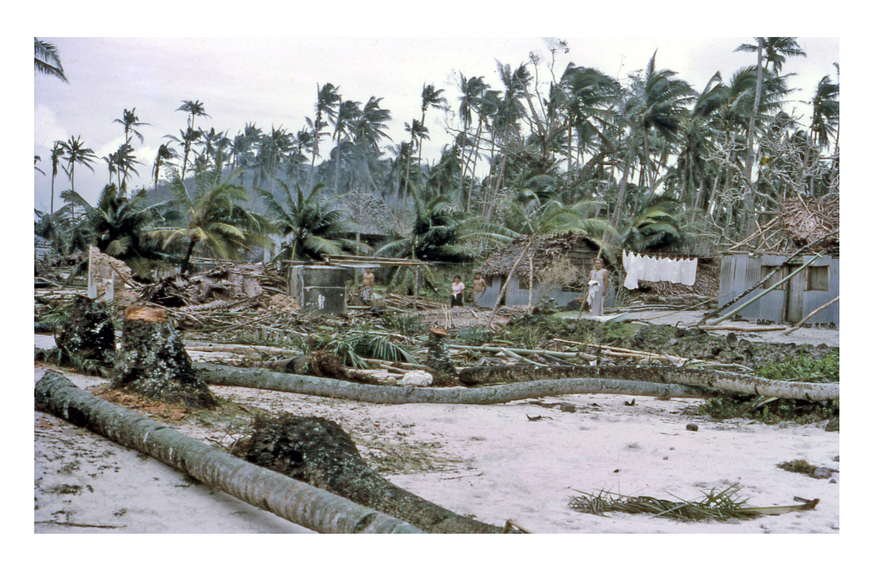
Devastation from Hurricane Bebe (Rotuma, 1972).

volunteer from September 1989 until December 1991. He contributed a set of 19 miscellaneous photos for uploading.